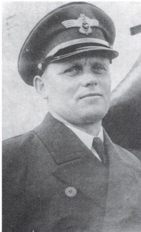
A Lufthansa pilot