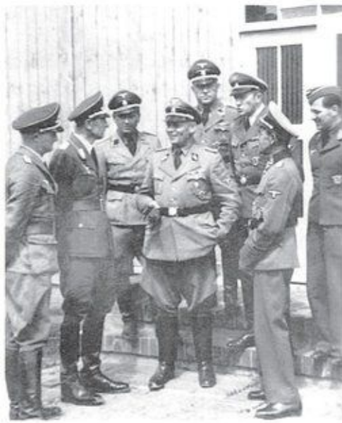
Baur in discussions with his escort pilots and security personnel in Vinnitsa, Ukraine