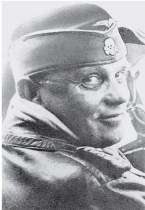
At the controls of the Führerplane