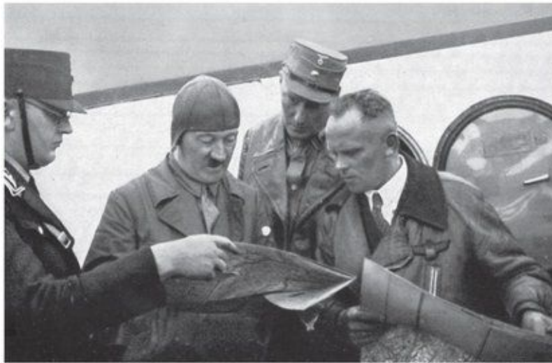
Baur briefing Wilhelm Brückner and Hitler on flight plans in 1932