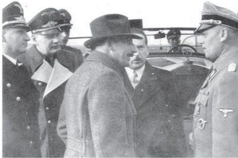
King Boris of Bulgaria with Baur after a flight