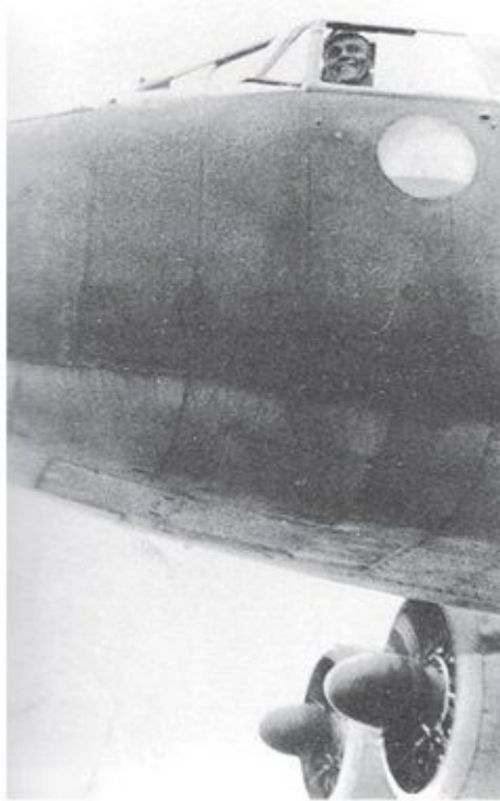
At the controls of the Condor Fw-200 in 1942