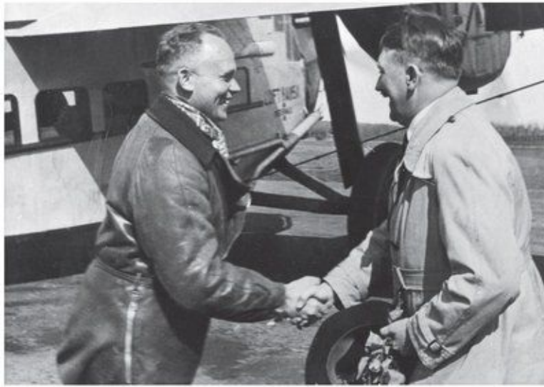
Warm greetings in 1932