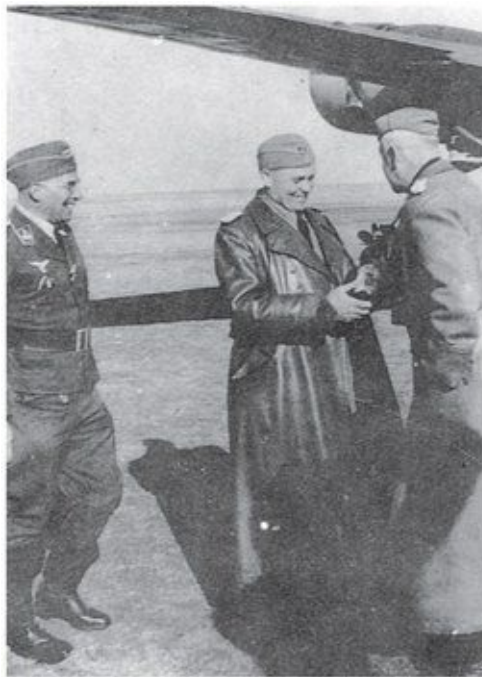
Field-Marshal von Manstein presenting Baur with a bottle of champagne in the Crimea