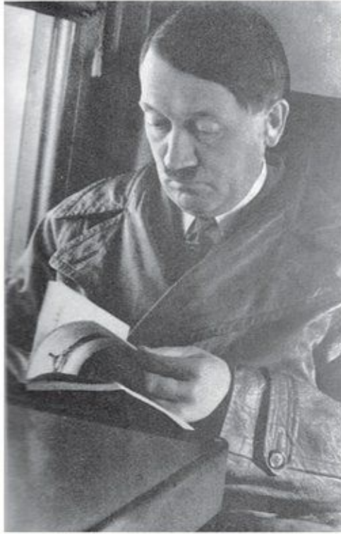
Hitler relaxes during a flight over Germany in 1932