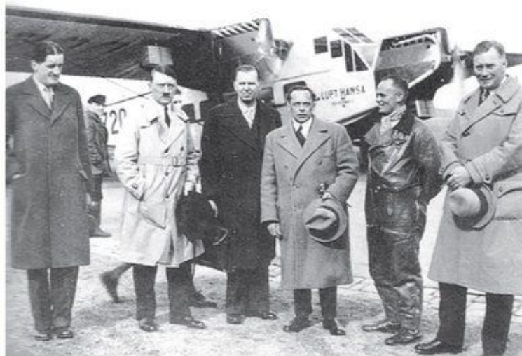
During the 1932 election flights: (left to right) Dr Hanfstengel, Hitler, Julius Schaub, Heinrich Hoffmann, Baur and Wilhelm Brückner