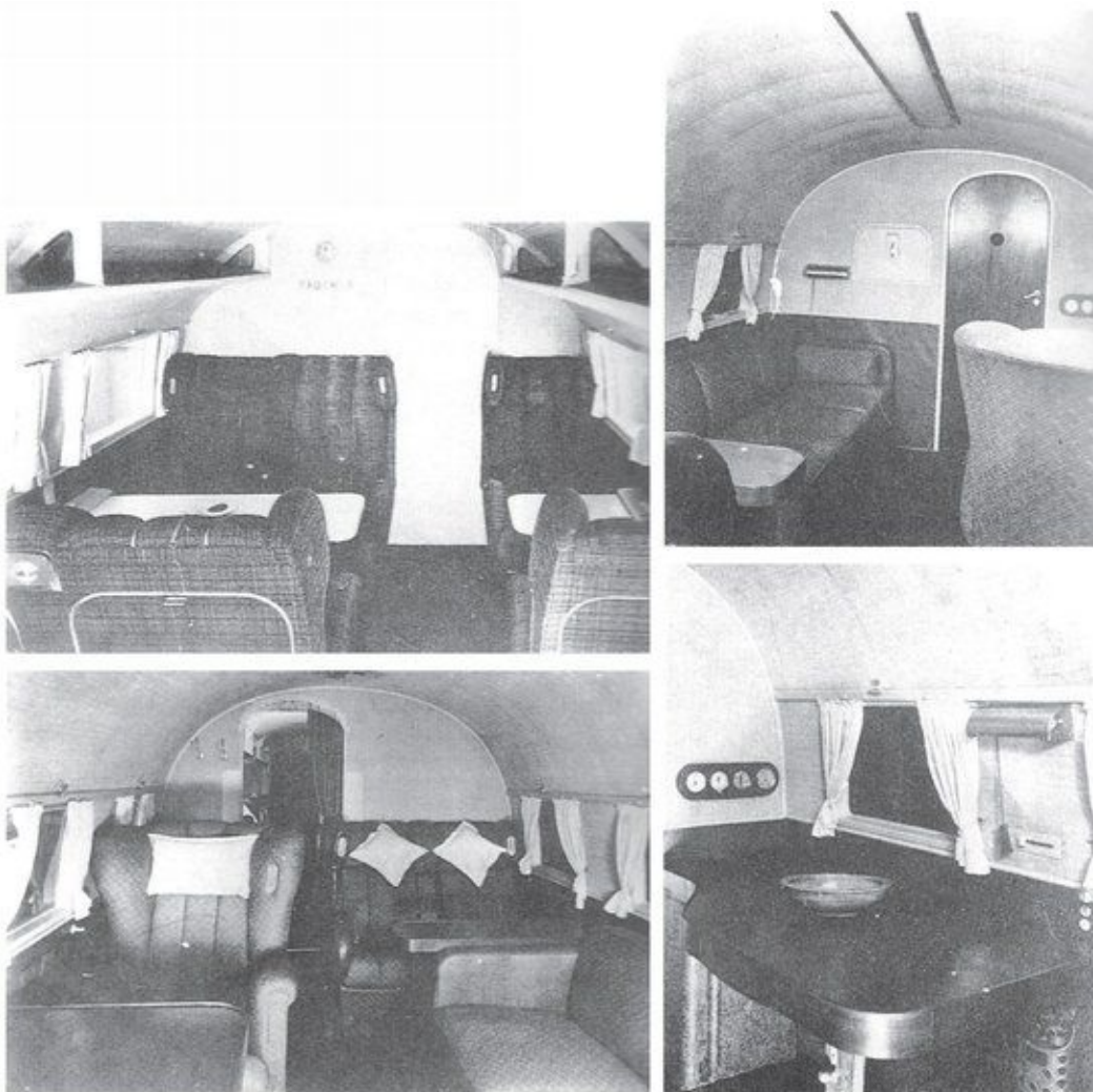
Views of the interior of Hitler's Ju.290