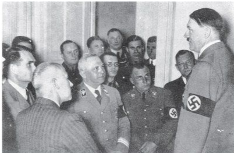
On 28 March 1936, on the eve of the election, Hitler meets with his closest advisers. Baur is at the left of the picture with Hess.

A youthful admirer in Berlin gets Baur's autograph