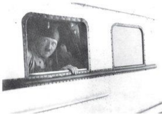
Before an election campaign in 1932. Hitler peers pensively from the chartered G-24