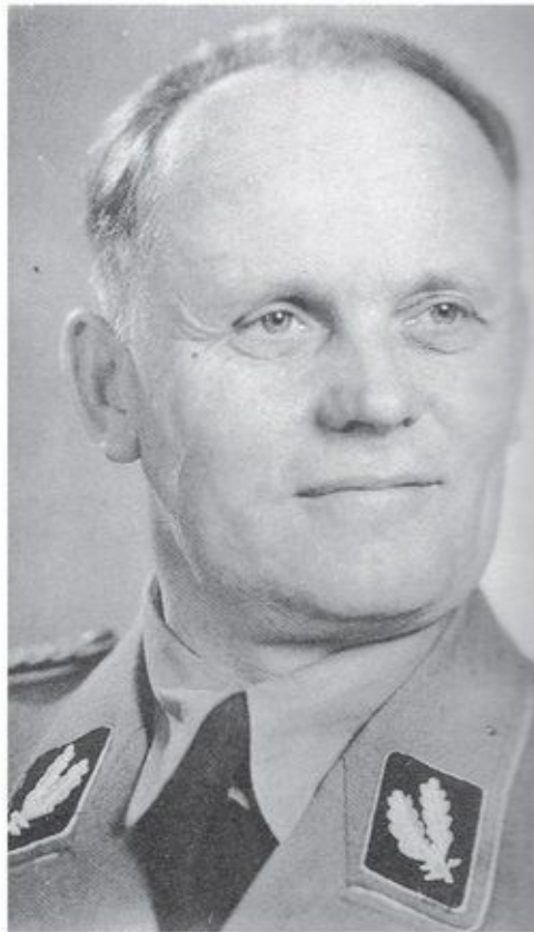
A General in the Second World War