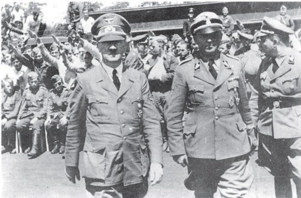
Hitler, Baur and Bormann visit a military field hospital