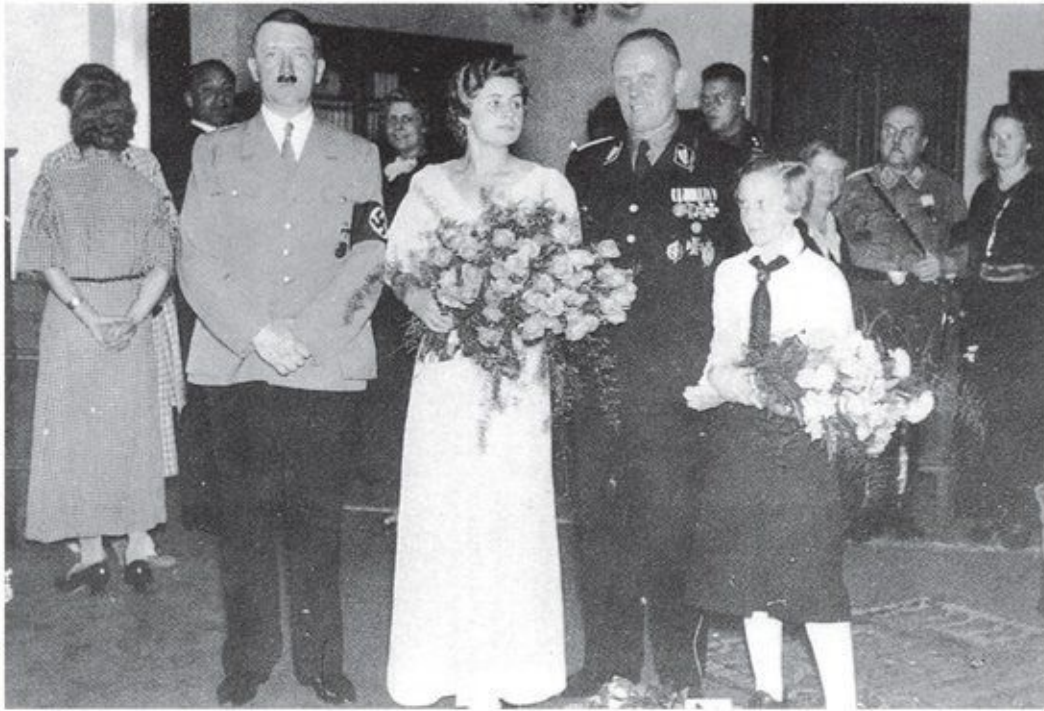
Baur's wedding day on 13 May 1936 at the Führer's Munich apartment. Hitler was best man. Baur's 12 year old daughter by his first wife is on the right of the picture in BDM uniform